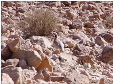
I've included photographs of some of the species that we saw: Chukar, Great Grey

During our recent trip to Kibbutz Lotan in Southern Israel, my wife Rose thoughtfully arranged for me to enjoy three days of birding with a guide. It was a fabulous experience. The kibbutz arranged one of Israel's leading guides to lead the tour at the height of the bird migration from Africa through Israel to Europe and Asia. During the three-day trip, I saw over 100 life-species, and photographed approximately 80 new species. Habitats included salt-settling ponds from the Red Sea, sewage treatment plants, date plantations, farms and dessert wadis.