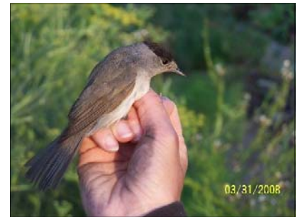
nets and traps to catch the birds so that they could be banded. The banders skillfully handled the birds to collect measurements and band the birds. A photo of Blackcap is shown.

The highlight of the trip for me was birding the wadis, dry river beds in the desert. These seemingly desolate strips of green vegetation and Acacia in the middle of the Negev serve to concentrate a wonderful range of dessert species and migrants.