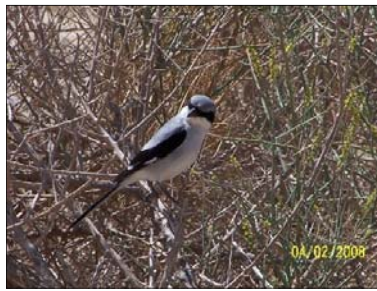
Shrike and the very exotic Hoopoe of biblical fame (my favorite bird of the trip.)